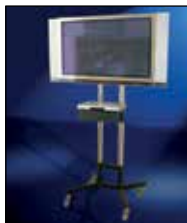
LED TV Screen 42" & 32"