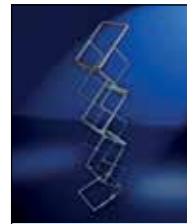
Brochure Holder Zig Zag