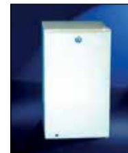
Refrigerator 48 x 53 x 82 cm