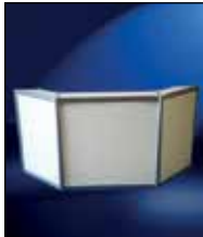
Information Counter 200 x 50 x 100 cm

Godolphin Ballroom, Jumeirah Emirates Towers, Dubai, United Arab Emirates