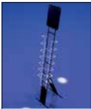
Brochure Rack Free Standing