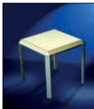
Coffee Table 50 x 50 x 45 cm