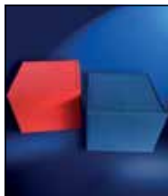
Coffee Table 50 x 50 x 45 cm