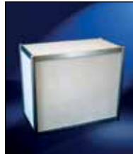
Lockable Counter 100 x 50 x 90 cm