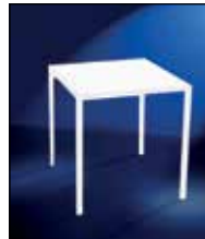
Square Table White - 70 x 70