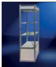
Octanorm Tall Showcase 50 x 50 x 200 cm