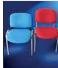
Upholstered Chair Blue / Red