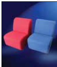
Sofa Seat Red / Blue