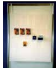
Small Pegboard 90 x 120 cm