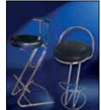
High Stool Chrome