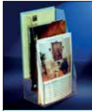
Brochure Holder Table Top