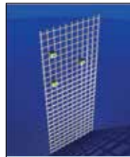
Grid Panel 90 x 180 cm