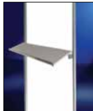
Slope Shelf 100 x 30 cm