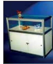
Octanorme Showcase 100 x 50 x 90 cm