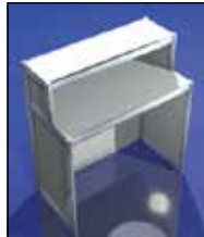
Reception Counter 100 x 50 x 105 cm