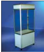
Tall Showcase 85 x 45 x 190 cm