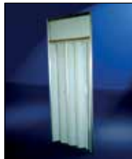
Folding Door 200 x 100 cm