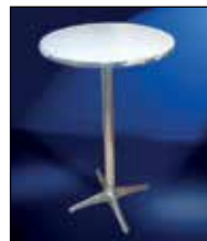
Bar Table D=60, H=120 cm