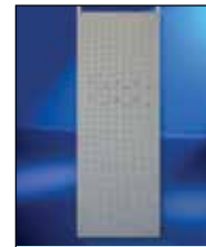
Big Pegboard 90 x 240 cm