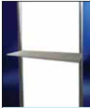
Flat Shelf 100 x 30 cm