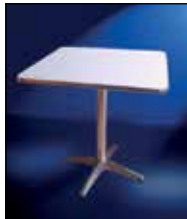
Square Table Chrome - 70 x 70