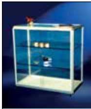
Low Showcase 100 x 50 x 100 cm