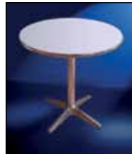
Round Table Chrome