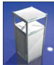
TV Stand 50 x 50 x 120