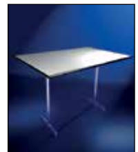
Large Table 120 x 70 x 75 cm