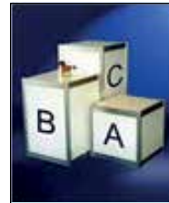
Exhibit Base H=50 x 50 x 50 cm H=50 x 50 x 75 cm H=50 x 50 x 100 cm